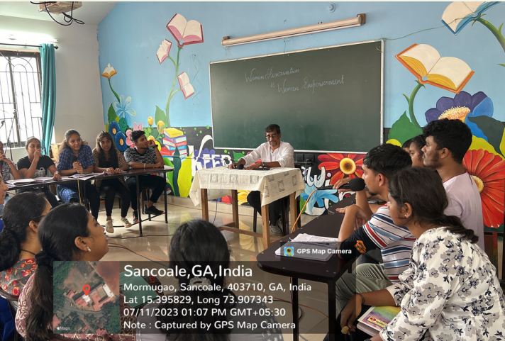
Contents in action at the debate competition