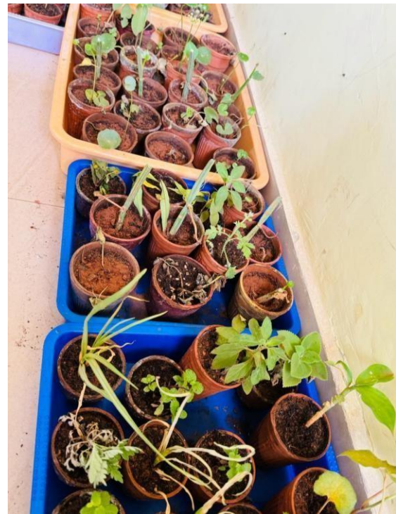
Medicinal Plant Gallery