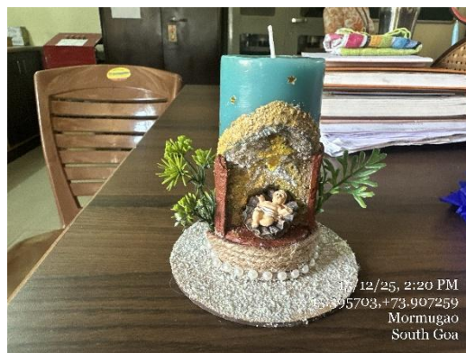
Candle Decoration Competition held for Students during Christmas