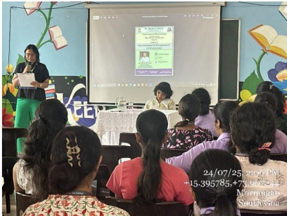
The Monsoon Photography competition on the theme “Monsoon Mysteries: Mixrobes in Focus”