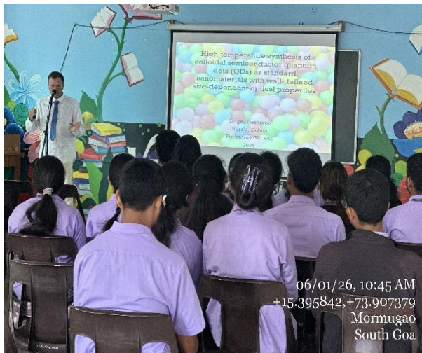
Department of Chemistry in Collaboration with the RDI Cell and IIC Cell conducted a workshop on Synthesis of Colloidal Semiconductor Quantum Dots