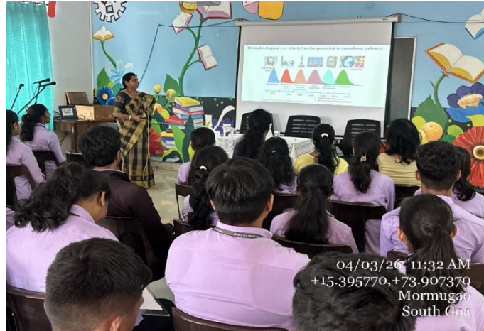
Seminar on Research Progress in Biotechnology using extremophilic Microbes