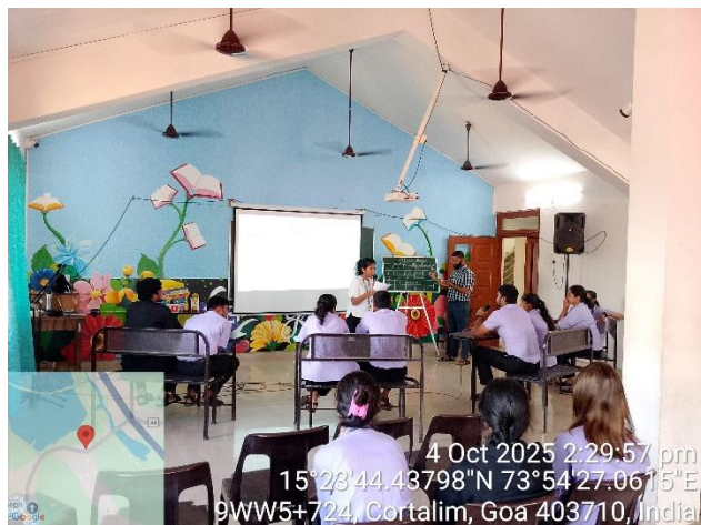
Mathematic Quiz held for students