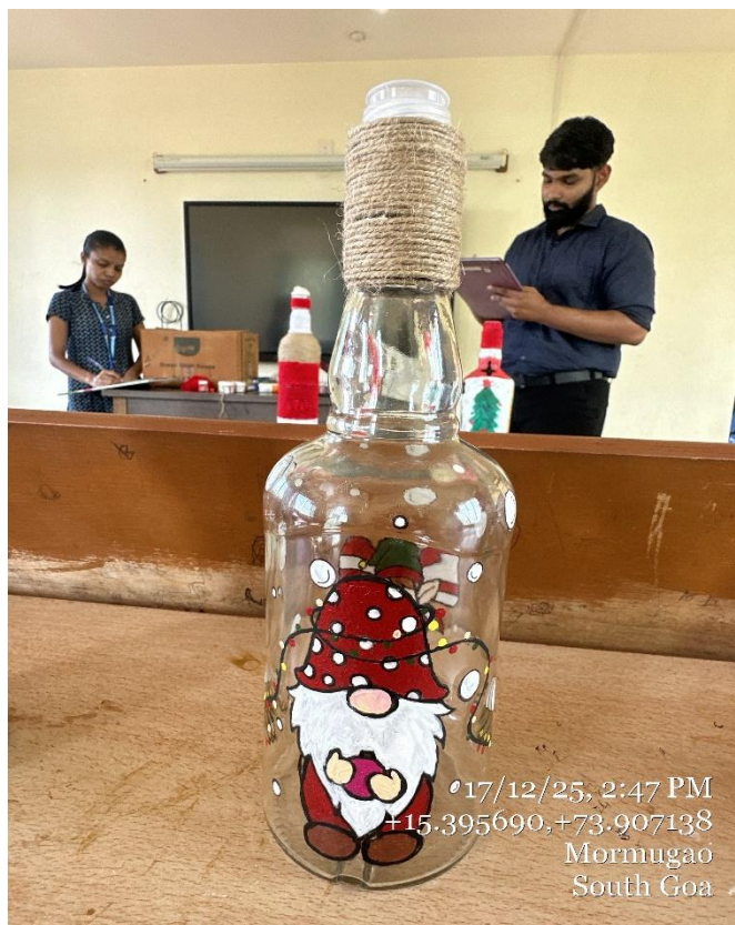
Bottle Painting competition held for students on the occasion of Christmas