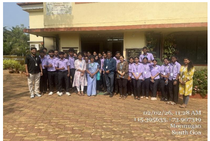
Explore Khazans: A unique heritage of Goa