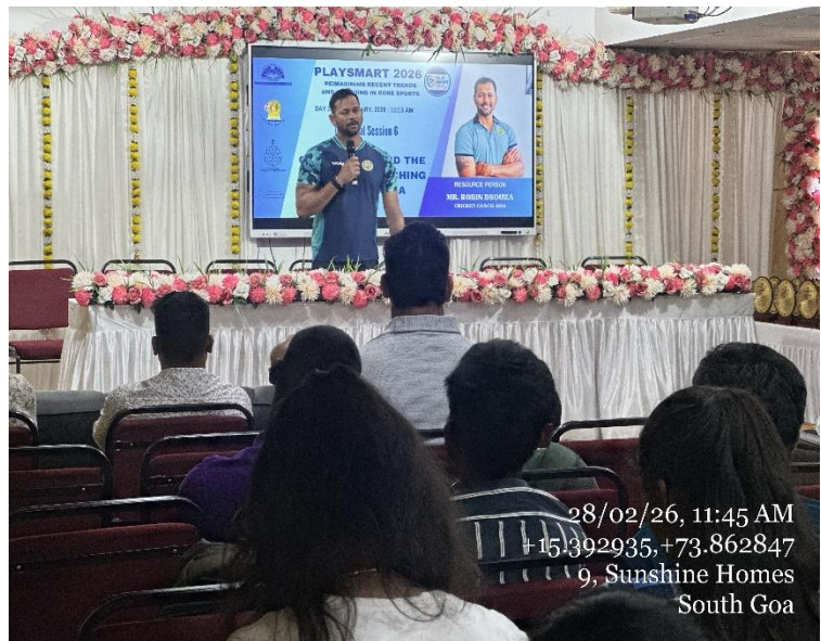
National Seminar in Sports held in collaboration with MES Joshi Vasant College, Dambolim

28/02/26, 11:45 AM +15.392935,+73.862847 9, Sunshine Homes South Goa