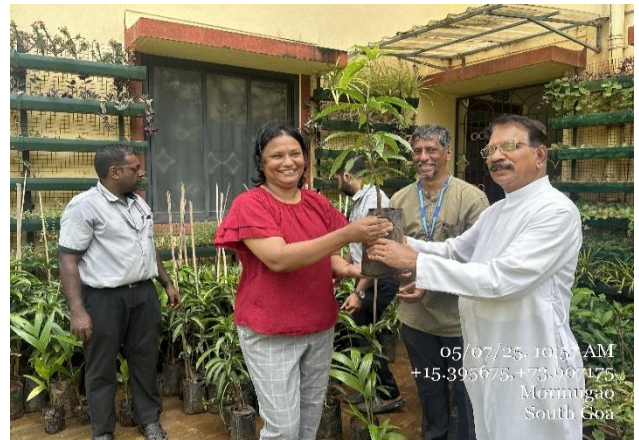
Plants distributed among staff and students on Vanamahotsav -Ek Ped Maa Ke Naam