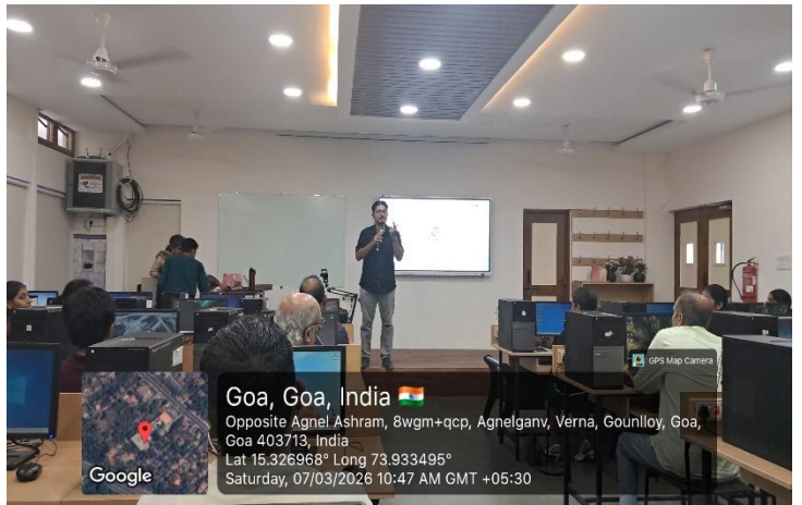
National Summit on Geospatial Technology 2.0 held in Collaboration with Padre Conceicao College of Engineering