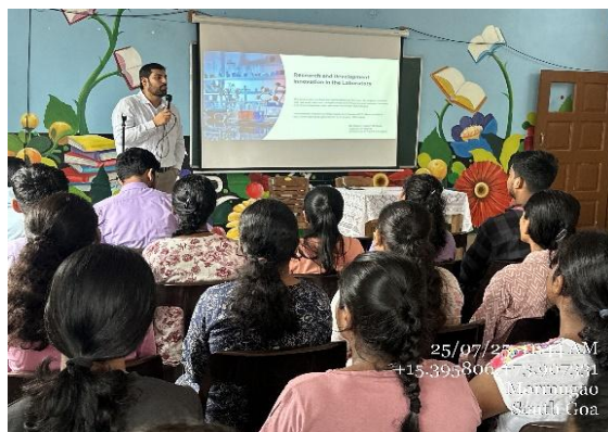
R&D Innovation in the Chemistry Laboratory from Classroom projects to Real World Solutions