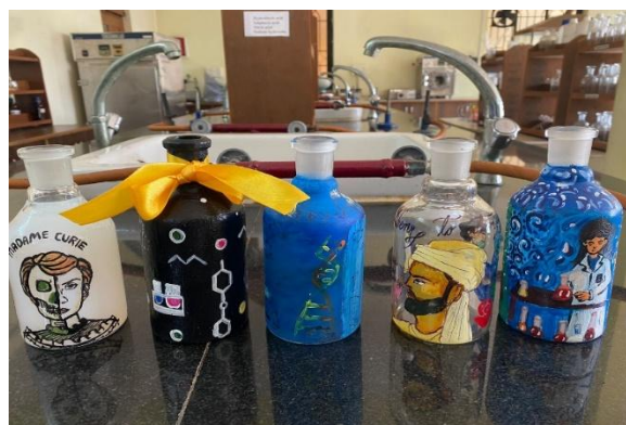
Bottle-Painting Competition held for Students